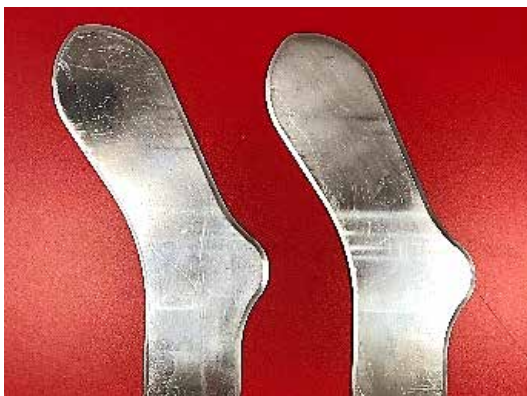
20° foot shape forms